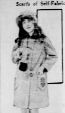
Cutting pockets, seams, collars and other style details which count so much in the happiness of the schoolgirl are conspicuously present in most of the junior coats for autumn and winter.

Touches of fur and another note of interest as pictured, went to an open section in the skirt part of down and spent some time in games. The most amusing was a mock foot-ball game, with a peep squad and all the other features.