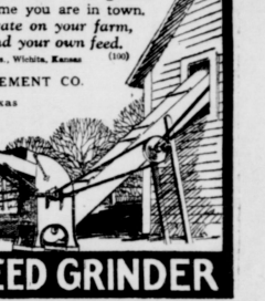
W-W HAMMER TYPE FEED GRINDER

Grinds Any Feed From the Ground Up! The W-W Hammer Type FEED GRINDER grinds any grain and in addition handles alfalfa, fodder, bundle feed, etc., either separately or together with grain, without a single extra attachment.