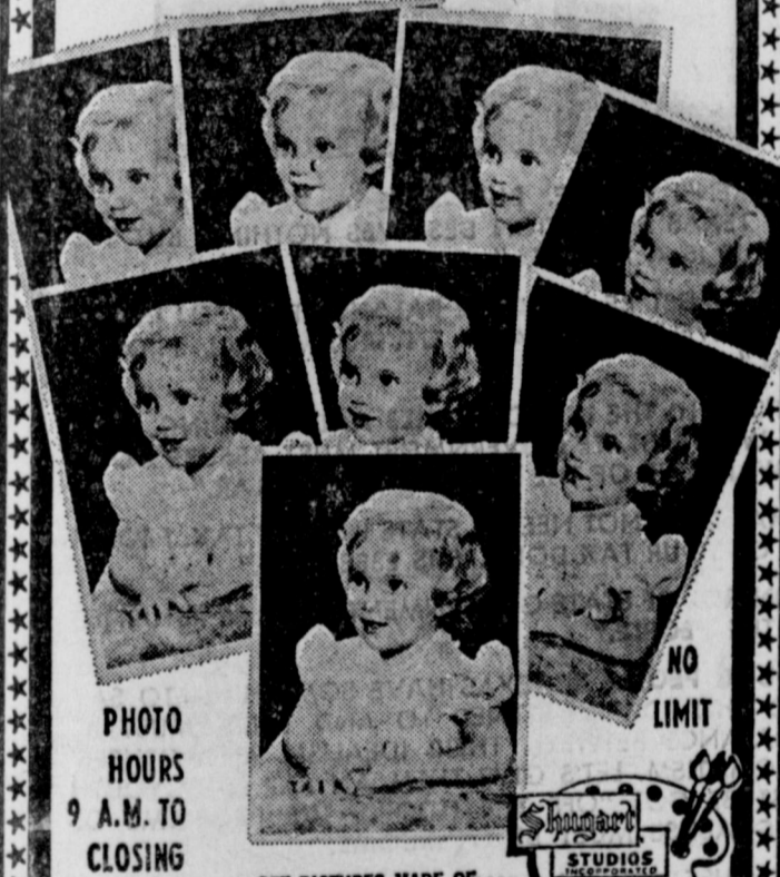
PHOTO HOURS 9 A.M. TO CLOSING

GET PICTURES MADE OF GRANDPA, GRANDMA, DAD, MOM AND ALL THE LITTLE ONES AT THESE SAME LOW PRICES!