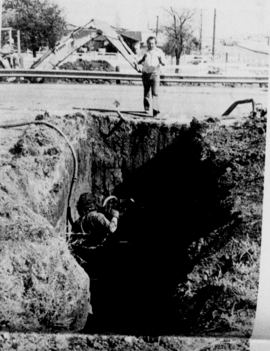
DIGGING FOR WATER? Nope, workmen were boring beneath Johnson Road this week as part of a project to lay telephone lines underground through the north side of Iowa Park. The effort is part of a 50-mile project to connect underground lines between Wichita Falls and Vernon, which eventually will connect the Dallas and Fort Worth area with Amarillo, all underground. The line will have 14,000 circuits. Eventually there will be no overhead lines along the route served by Southwestern Bell Telephone.