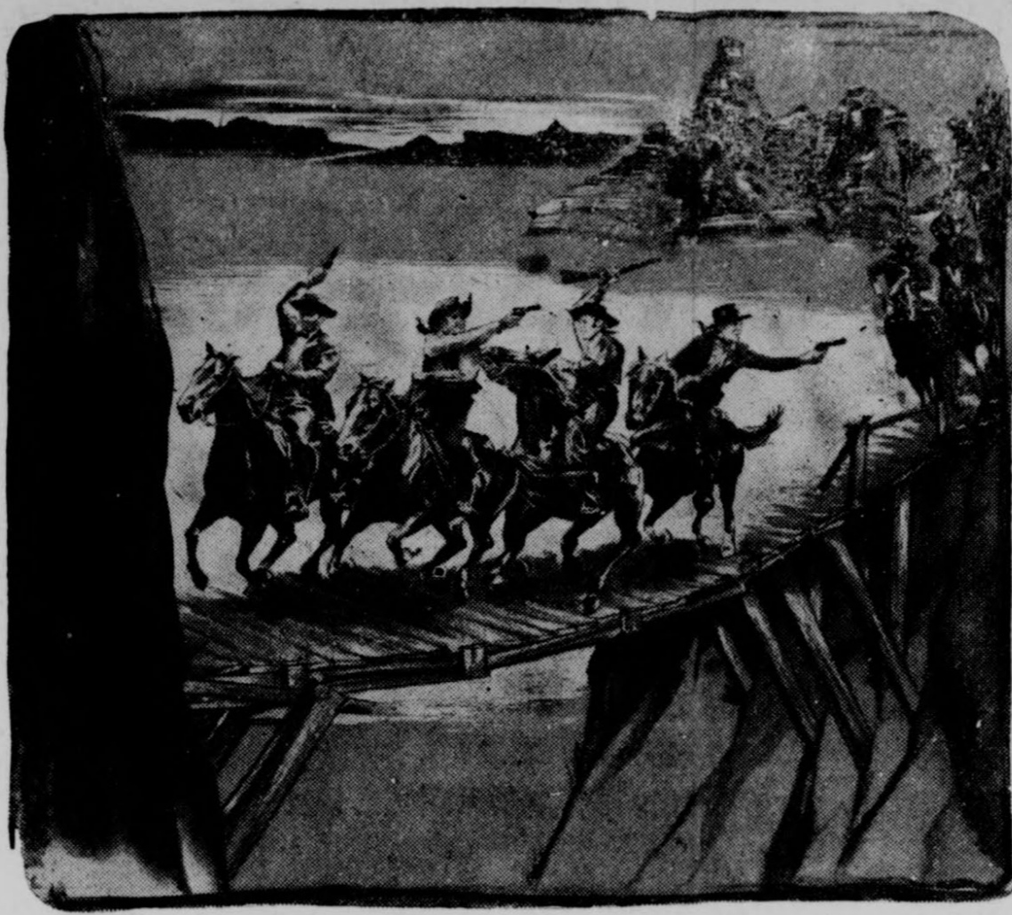
"THE YOUNGER BROTHERS" Thrilling Western action epic starring Wayne Morris, Janis Paige and hundreds of others, comes to the Parkway Theatre in Iowa Park for Tuesday, Wednesday and Thursday of next week, September 13, 14 and 15.

"Back to school and back to the Bible school" is the theme for Sunday with special emphasis on the fall church program.