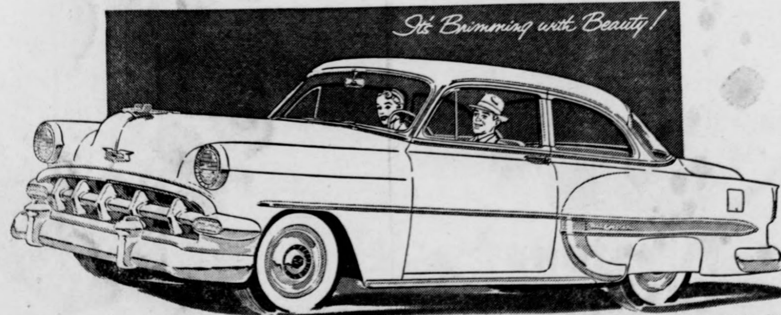
The new 1954 Chevrolet Bel Air 2-door sedan. With three great series, Chevrolet offers the most beautiful choice of models in its field.

Only the '54 Chevrolet gives you all these features at lowest prices!