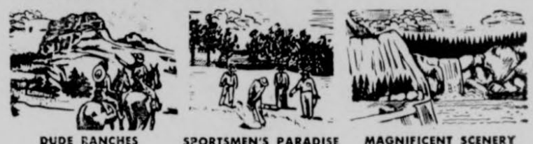
DUDE RANCHES SPORTSMEN'S PARADISE MAGNIFICENT SCENERY

The Rockies are never more magnificent than when fall's crisp, colorful beauty blankets their peaks and canyons... and it's all just one Zephyr night away from Texas! Reserve Zephyr accommodations now to this thrilling wonderland of picturesque dude ranches, luxurious resort hotels, trout streams, camps, hiking and riding trails—the answer to every vacation wish! Remember these Zephyr advantages: • Safe, comfortable, air-cooled Pullmans and chair cars. • Superb meals in clean, air-conditioned dining cars. • Spacious dressing rooms. • Baggage-checking privileges—everything you need to take with you! Mail the coupon below for your choice of free literature on a Zephyr vacation in America's Grandest Vacation Region!