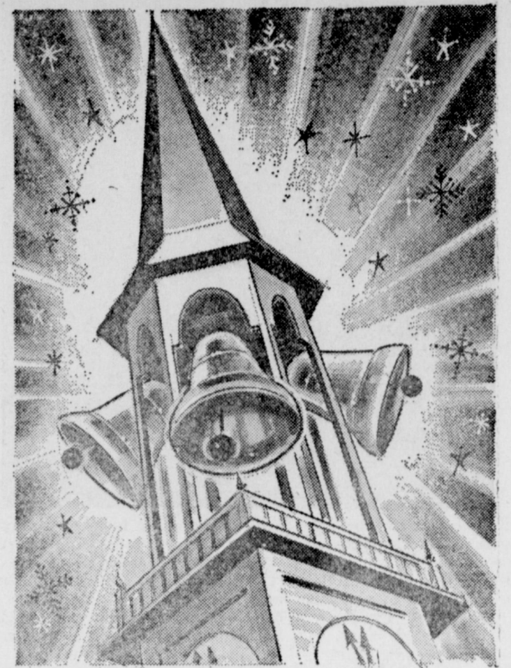
The happy sound of bells announces the glorious New Year Day, and with it goes our sincere wish for your health and happiness.