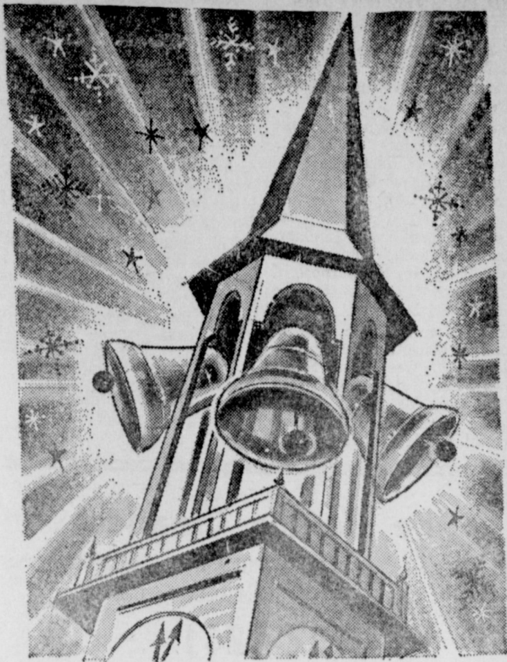
The bells ring out . . . the clocks strike twelve . . . and 1967 has come to stay. Let us resolve to make it a worthwhile year.