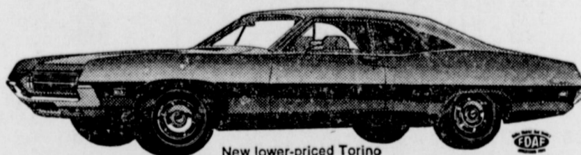
New lower-priced Torino

New special included in North Texas Ford Dealer Economy Clearance