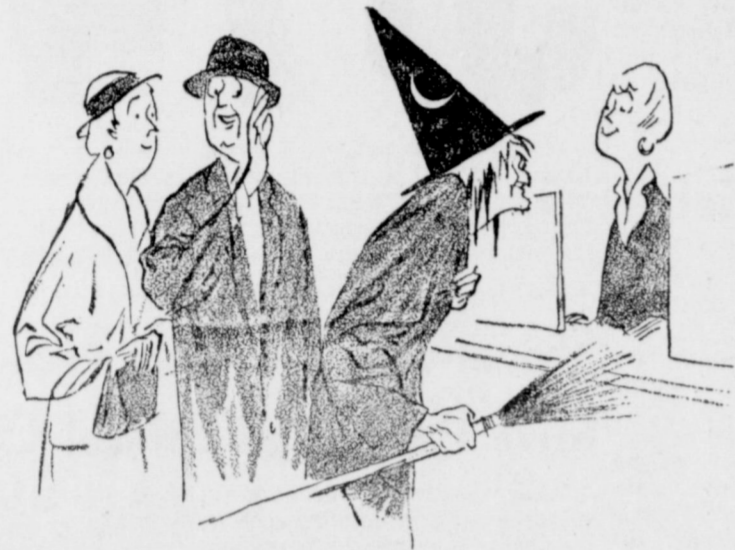
"They're friendly to everyone at the"