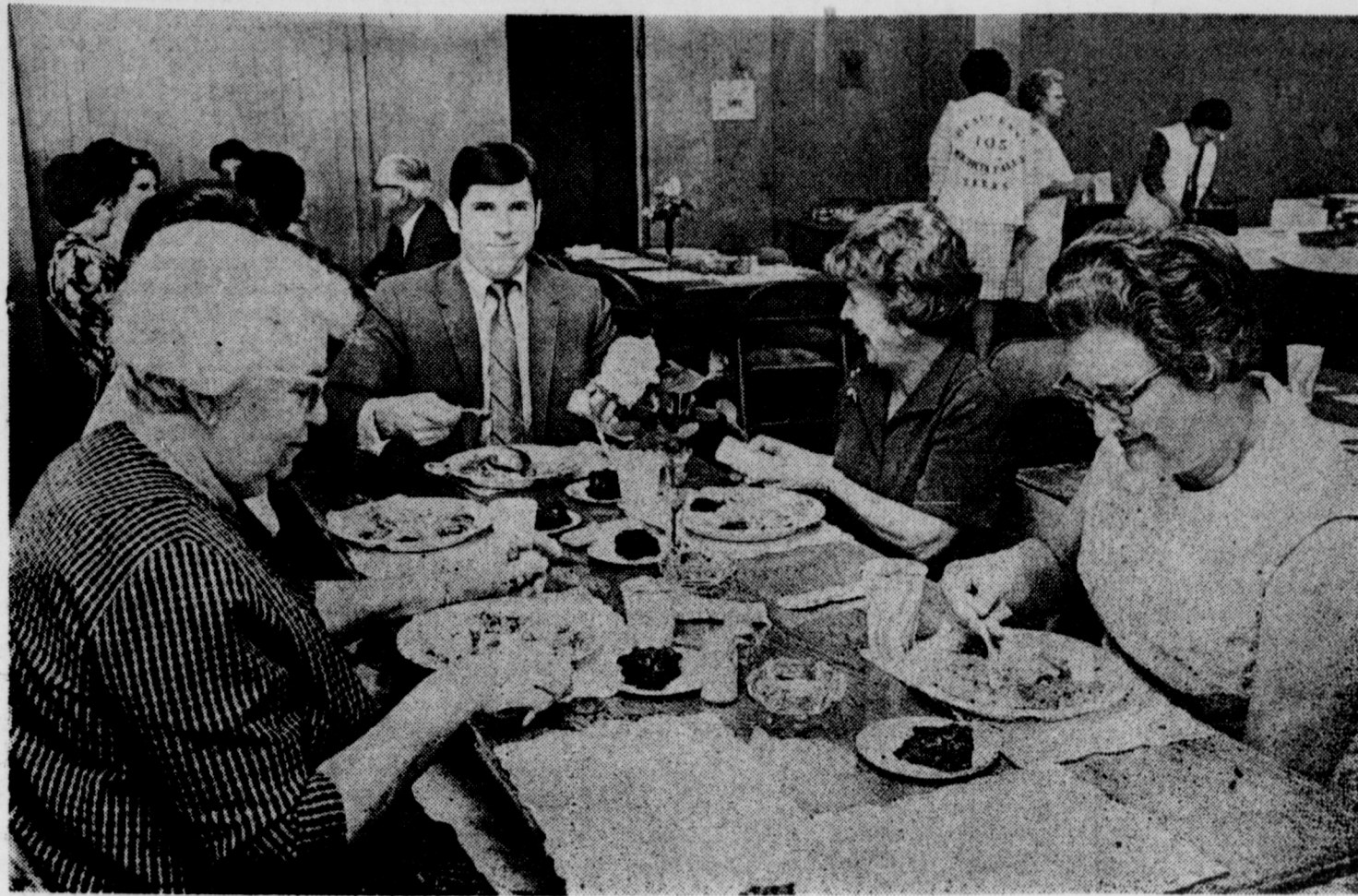
Recently the Social Order of Beauceant of Wichita Falls had a tasting luncheon which featured