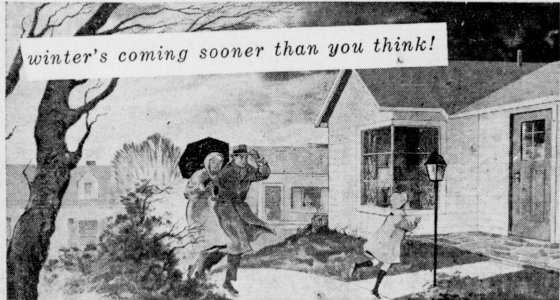
winter's coming sooner than you think!

See the Chevy Show, Sunday night on NBC-TV and the weekly Chevy Showroom on ABC-TV. Impala Sport Coupe with Body by Fisher.