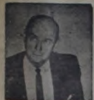
CONGRESSMAN WALTER ROGERS' WASHINGTON REPORT