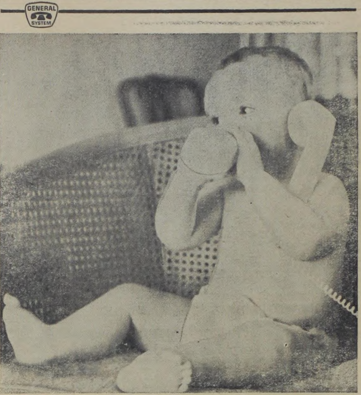
"Yes, you're interrupting my dinner, but while I'm eating I can talk on our extension telephone."