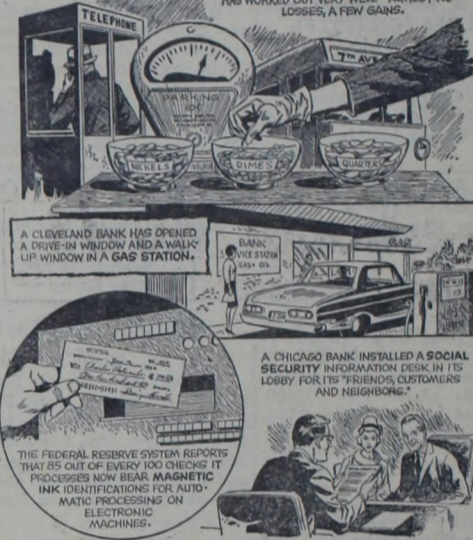
A CLEVELAND BANK HAS OPENED A DRIVE-IN WINDOW AND A WALK-UP WINDOW IN A GAS STATION.

DID YOU KNOW... MANY BANKS KEEP BOWLS OF COINS IN THEIR LOBBIES SO CUSTOMERS CAN MAKE THEIR OWN SMALL CHANGE FOR PHONE CALLS, PARKING METERS, BUS FARES, ETC. THIS HACKER SYSTEM HAS WORKED OUT VERY WELL—ALMOST NO LOSSES, A FEW GAINS.