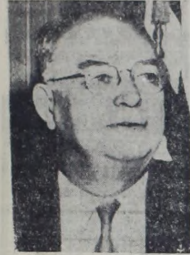
LEADS DEMS . . . Sen Earle C. Clements (Ky.) takes over as acting Senate majority leader during illness of Sen. Lyndon B. Johnson (Texas).