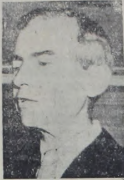
NEW AIR CHIEF . . . Donald A. Quarles, 61, was named Air Force secretary by Pres. Eisenhower to succeed Harold Talbott. He was in charge of guided missiles for defense dept.