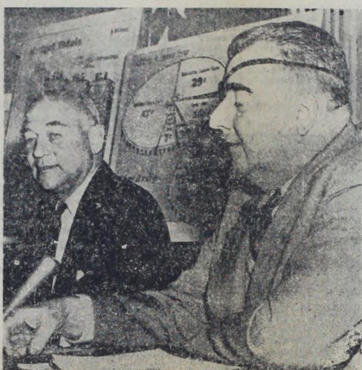
REPORT ON BUDGET . . . Treasury Sec. Gen. Humphrey (left) said we "should and can" balance U. S. budget this year, as budget director Rowland Hughes shows charts.