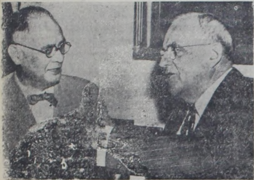
JAP-U. S. CONFERENCE . . . Japanese foreign minister Shigemitsu (left) meets with U. S. secretary of state John Foster Dulles for "world-wide review."

for BUYING SELLING TRADING RENTING LOANING