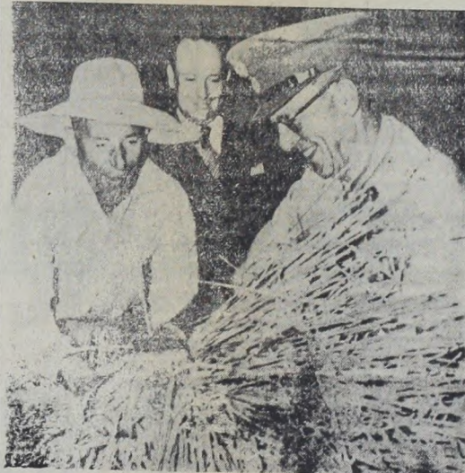
ROYAL FARM HAND . . . King Paul of Greece inspects wheat sheaf as he and other royal family members took part in harvest festival at Larissa, Thessaly.