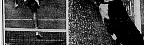
FULL FLIGHT: Camera catches Margaret Smith in leaping backhand smash as she won U.S. tennis title.