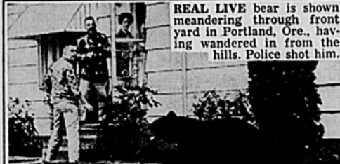
REAL LIVE bear is shown meandering through front yard in Portland, Ore., having wandered in from the hills. Police shot him.