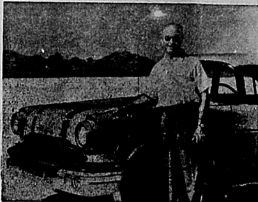
YOUNG AT 73 —Still in the grueling business of testing automobiles at 73, Ab. Jenkins, veteran race driver, just set a new 24-hour stock car distance record on the Bonneville Salt Flats in Utah. Under sanction of the National Association of Stock Car Racing he drove a 1936 Pontiac which covered 2,841 miles at an average speed of 118.375 miles per hour.