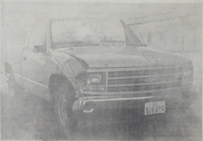
A 1988 Chevrolet Pickup belonging to Mack Seymour sustained damages recently from a hit & run accident. The auto was parked in front of the Seymour home when the incident occurred.

aid us in programs to make our city more appealing to the investor and tourist.