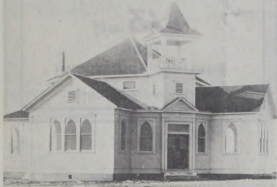
Flomot First Baptist Church Dedicated March 10, 11, 1917. Existing building erected in 1959.