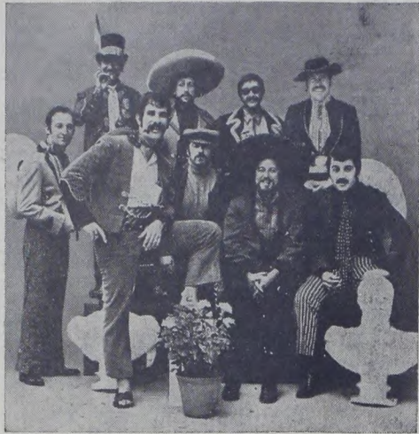
The Baja Marimba Band