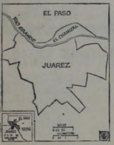
Map locates new channel (broken line) excavated for construction of the Adolfo Lopez Mateos Canal.

Result: by 1962 the meandering stream had bequeathed some 400 acres of land, called "El Chamizal," to El Paso. But in this age of earthmoving behemoths, even intangible things like international boundaries can be set aright, especially between friendly, understanding neighbors like Mexico and the United States.