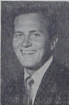
Pat Boone ☆☆☆

Lubbock - The White Sands, N.M., Missile Range will display a series of missiles and an electronic exhibit at the 51st annual Panhandle South Plains Fair here Sept. 23 - 28.