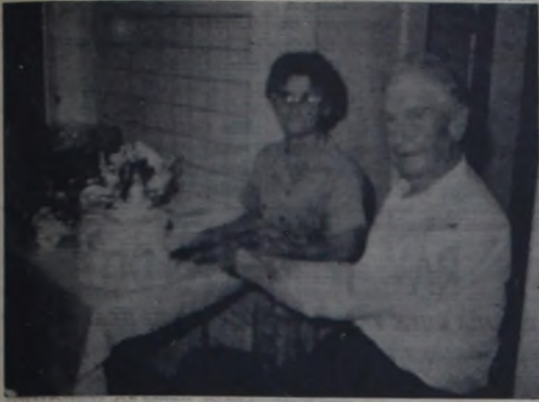
ATTEND GOLDEN WEDDING