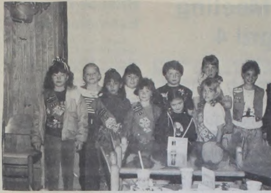
This is a recent photo showing the Girl Scouts from Troops 217, 366, and 420 on a recent trip. The Girl Scouts will be going to Plainview on Sunday, April 7 to go skating. All past dues must be paid in full in order to attend this fun event.