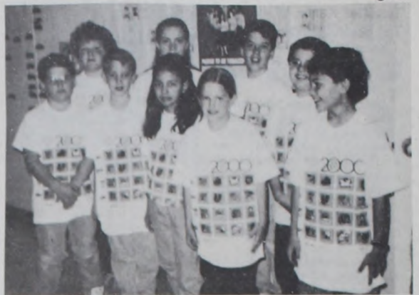
These 5th grade students are wearing their Smoke-Free 2000 T-shirts as a symbol of their pledge to stay Smoke-free.