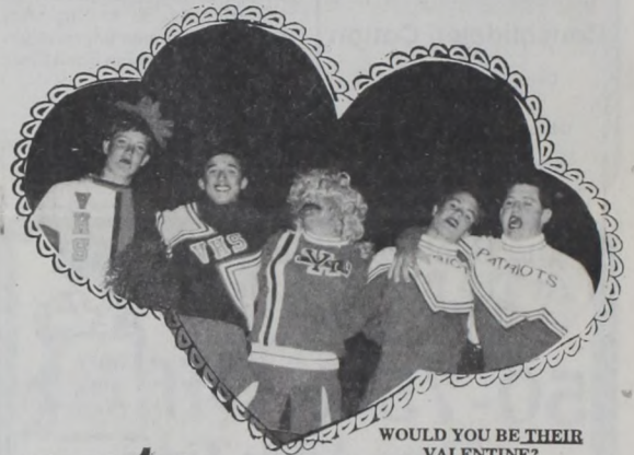
WOULD YOU BE THEIR VALENTINE?