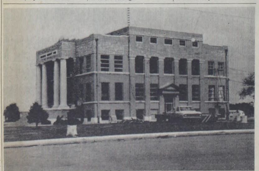
New aluminum-frame windows are being installed in the Briscoe County Courthouse. The project is being completed with money the county has received from the new revenue sharing program.