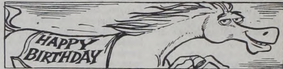
The universal birthday for any horse born in any year is January first.

April 1, 1989 Texas Trash-Off Day Don't Mess With Texas