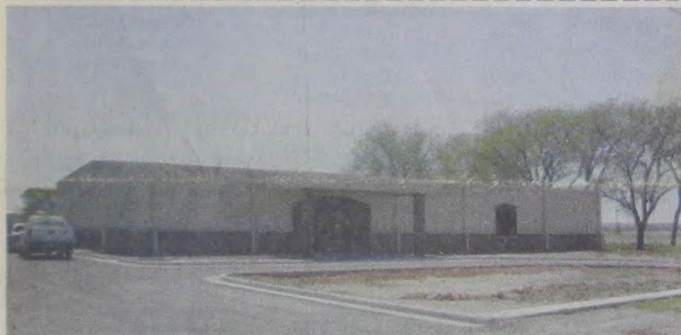
The Hope Center, Quitaque's new Community Center, marks a new chapter for growth in the community. Grand Opening festivities are planned for June 7.

Start Making Plans Now To Attend October 8, 2005 at the Old Turkey High School For More Information Call: 423-1174 ~ 423-1315 ~ 423-1113