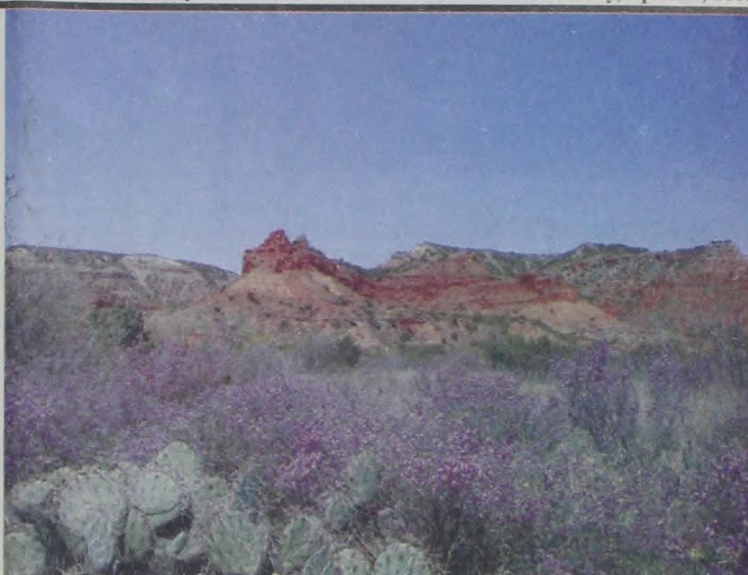
Spring at Caprock Canyons State Park is breathtaking adventure at every turn!

If you have not ever eaten a meal prepared on an open fire in a Dutch Oven then folks come on out to the Park on Saturday, to help with Volunteer Work Day, and work up an appetite, cause it's going to be some really great grub!