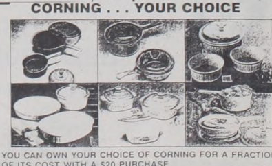
YOU CAN OWN YOUR CHOICE OF CORNING FOR A FRACTION OF ITS COST WITH A $20 PURCHASE