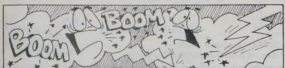
The sound of thunder is caused by the violent expansion of the air after it has been heated by lightning.

The great depression, as bad as it was, had a little good in it. I'm glad I was there then, and I'm glad I'm here now. I just hope I don't catch the itch again.