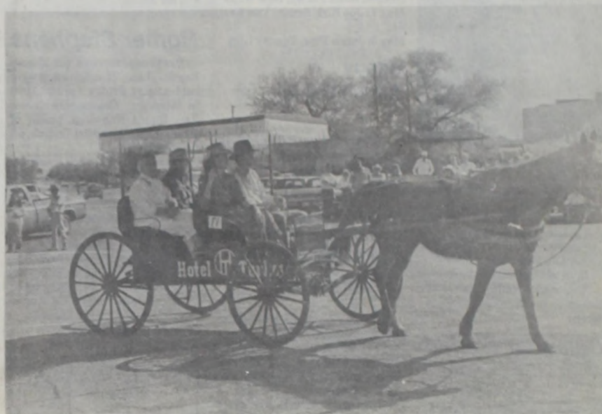
Hotel Turkey Surrey

Valley High School Track Meets 1990 April 28-Levelland-UIL Reg. May 5-Stephenville-6 man State May 12-Austin-UIL State