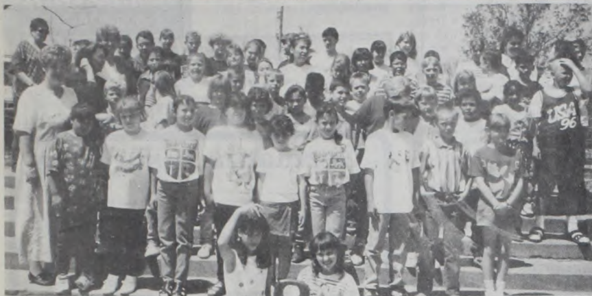
Valley Elementary UIL Students and Coaches from Valley School.