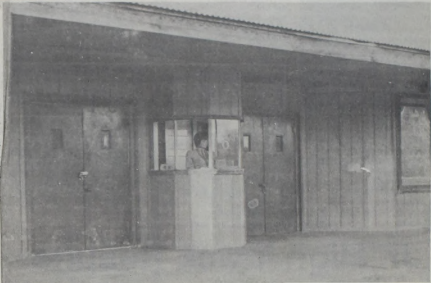
Now showing in downtown Turkey.

Commodities will be distributed on Tuesday, April 10, 1990 at the Quitauque Senior Citizens building from 1 to 5 p.m.