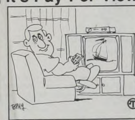
Pay-per-view turns a home into a personal movie theater.

For more great recipes made with convenient mixes, write for "Easy Baking," Martha White Kitchen, P.O. Box 58, Dept. 290-D, Nashville, TN 37202.