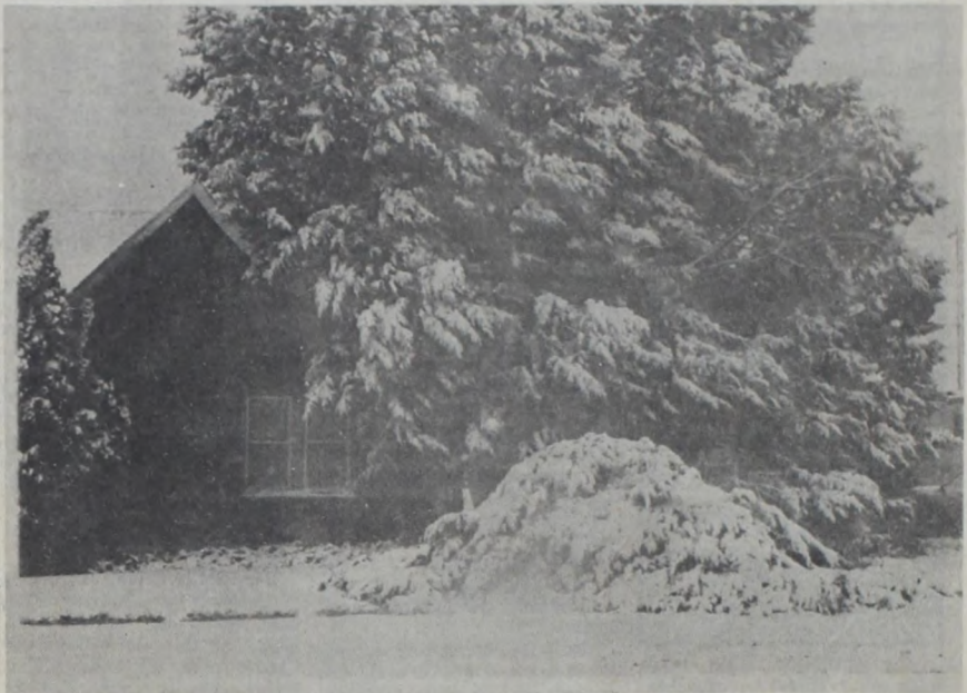
Picture perfect.....5 inch snowfall fell in the area last Saturday.

Please pick up your Birthday Calendars at W.T.U. in Turkey.