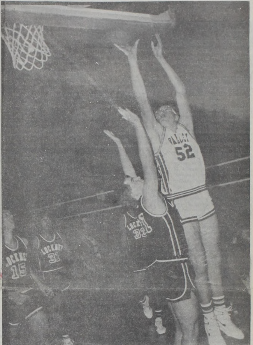
Valley Patriots Begin District Play Friday