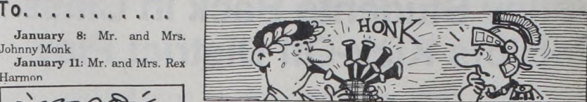
The bagpipe is an old instrument. It is spoken of in the Old Testament and it was used by the Egyptians, Greeks and Romans.