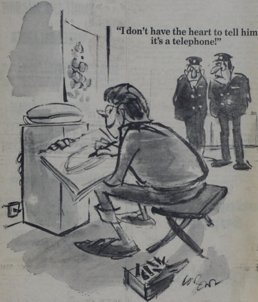
The Styleline™ telephone—with its dial hidden in the handset—is so beautiful that it looks like it belongs in a museum.