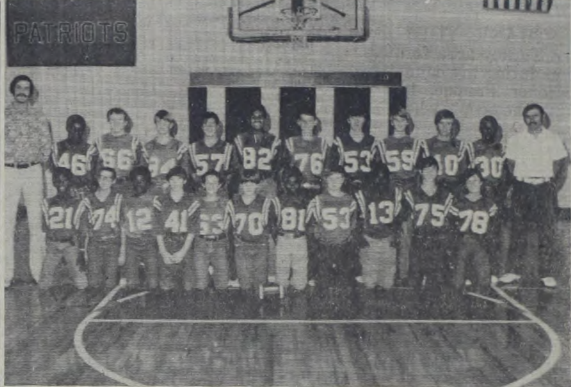
VALLEY JUNIOR HIGH TEAM closes out an undefeated season. The team shown above is the Valley Junior High Patriots who closed out their season at Motley County Thursday evening by thumping the Matadors for the