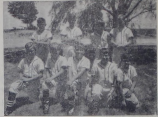
Turkey wound up its Little League and Pee Wee Baseball season with a weiner roast picnic. In the above photo a few of the kids are shown who took part in baseball action this season. In the bottom row left to right

THE VALLEY TRIBUNE — THURSDAY, JULY 31, 1969