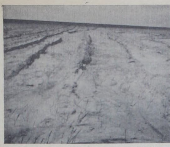
Stubble-mulching can greatly reduce this waste of soil. This field should also be terraced.