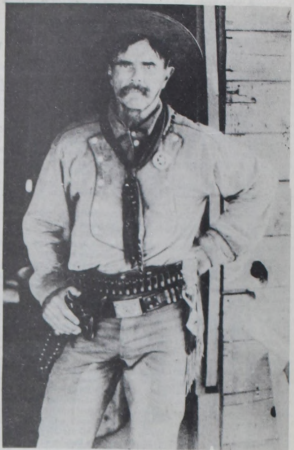
Actor and artist Buck Taylor will be in Amarillo Sunday, August 5, noon to 5 p.m. at the American Quarter Horse Heritage Center.

The American Quarter Horse Heritage Center & Museum is located along I-40 East at Quarter Horse Drive and is open from