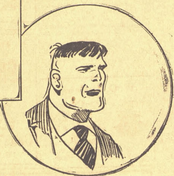
—And in this corner, DYNAMITE DUNN , Joe's fighter. And a great guy to meet—outside the ring.

THE fun and the thrills and the glamor and the excitement of the championship prize-ring are all found in the rollicking comic strip— JOE JINKS , featuring DYNAMITE DUNN . It's the story of Joe and his great slugger, Dynamite Dunn. If you like real laughs and real fights, you'll not want to miss a single day of