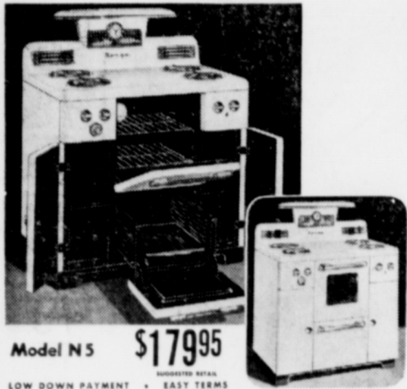
Model N5 $17995 SUGGESTED RETAIL LOW DOWN PAYMENT • EASY TERMS