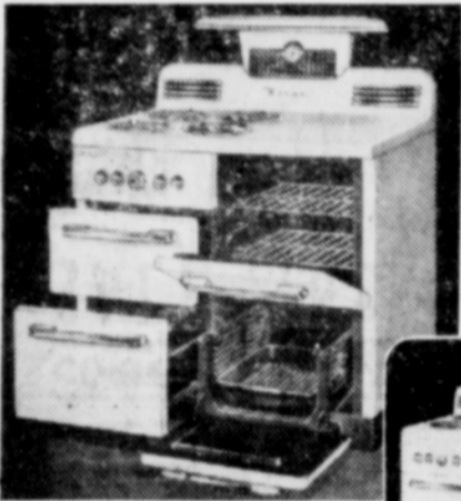
Model N4 $16995 SUGGESTED RETAIL LOW DOWN PAYMENT • EASY TERMS

Be sure to see the new 1950 Norge Gas Range with the exclusive Spir-O-lator Burners before you buy.