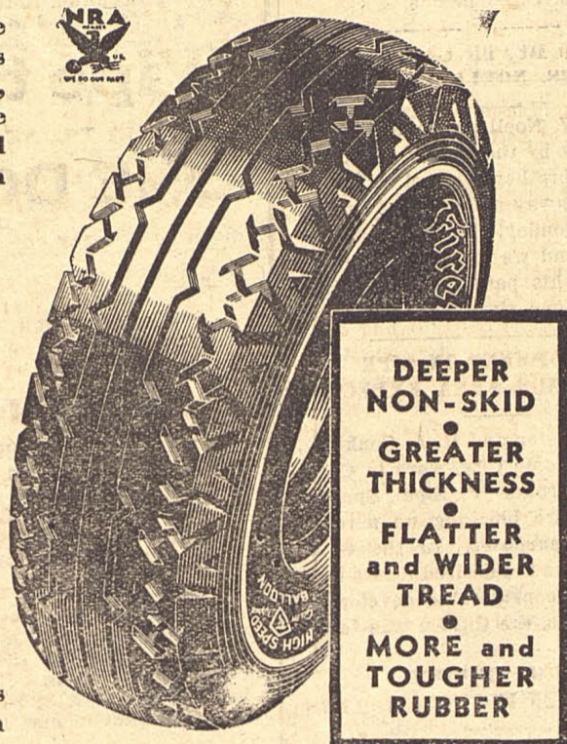
The Masterpiece of Tire Construction

Drive in today and replace your thin, smooth, worn tires with a new set of the Safest, Longest Wearing—and Most Dependable—Firestone has ever made