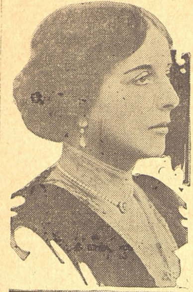
DUCHESS of ATHOL

The Duchess of Atholl, distinguished Celtic scholar, long interested in educational matters in Scotland, has been appointed Par-liamentary Secretary to the Board of Education in the Stanley Baldwin Cabinet. She was one of the four women elected to the House of Commons in the recent election.