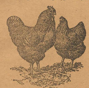
Pair of Barred Plymouth Rocks.