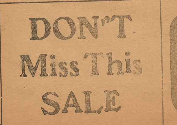
Remember THE DATE