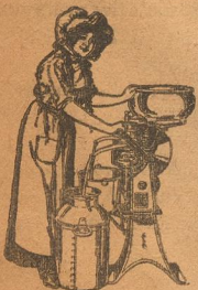
De Laval Cream Separators