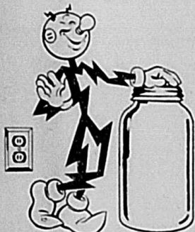
REDDY KILOWATT Your Electric Servant

"You can't can me! I have to be made the INSTANT I am needed!"