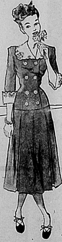
As seen in CHARM