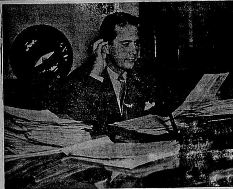
THE PEOPLE SPEAK — When Governor Allan Shivers invited the people of Texas to express their views on his program to improve the State Hospitals (termed by one survey group the worst in the nation), his mail picked up sharply. In this picture he is shown reading some of the letters, seeking ideas for the message he delivered to the Special Session of the Legislature this week. Virtually all the letters urged immediate action to improve these rundown institutions, the Governor reported.