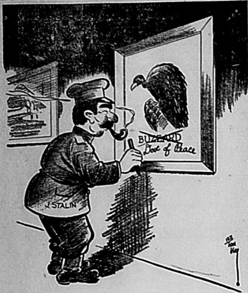
Who does he think he's fooling?