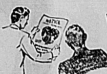
NOSE PRINTS OF DOGS, LIKE FINGERPRINTS IN MEN, ARE VALUABLE FOR IDENTIFICATION PURPOSES