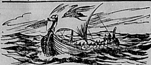
FIGUREHEADS OF GREAT DANES WERE USED BY THE NORMANS ON THE PROWS OF THEIR SHIPS