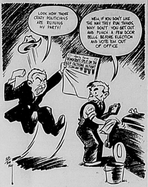
Time to Quit Gripping