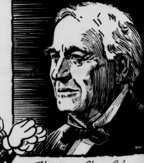
Thomas Alva Edison

AGO, before Thomas Edison invented a successful light bulb, lamps burned kerosene and candles that were expensive, and gave very poor light,—but,—