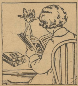
"Who Are You?" Asked Dorothy.

friendly companion to own—we can't -ve too many. And books are nice