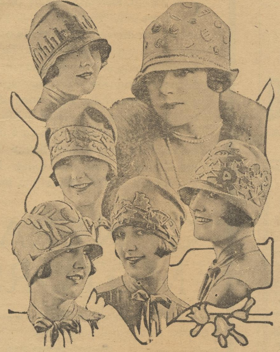
Some Hats From Paris.

with a white jersey or silk knit skirt. A convertible collar, such as styles the sweater in the picture is much to be desired as it adds both to its modishness and its utility. Knitted construction grows more and more complex. All sorts of fancy stitches are called into play to produce openwork stripes and novel lacy effects—in fact the newest things show these sheer filmy patternings, Quite out of the ordinary is the Turkish toweling knitwork, of which entire suits are made. Horizontal stripes play a colorful and spectacular part in sweaterdom Compose effects are also high-lighted throughout knitted modes. Another striking feature is the prominence