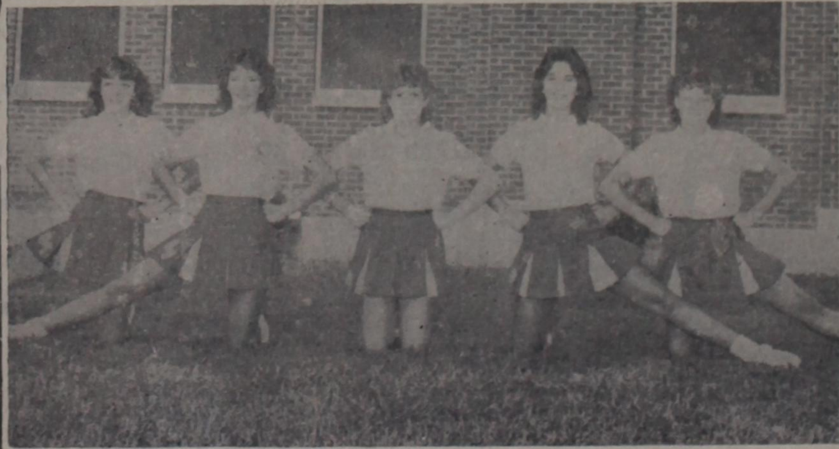
CHEERING THE BUFFALOES — These five members of the Cross Plains High School Buffaloes varsity cheerleading squad attended a National Cheerleaders Association camp held recently on the campus of